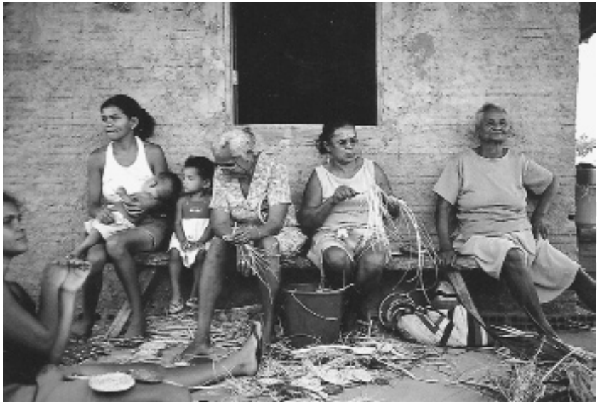
Figure 7.1 The Brazilian NGO Artesanato Solidario promotes income-generation activities using a cooperative model in which people produce handcrafted products using local knowledge and resources such as palm trees, which are then marketed by the NGO according to ‘fair trade’ product principles

A key trend identified by Biekart (2008) in the European NGO community which has gathered pace is the emphasis on socio-economic rights and economic development (see Box 7.6 for an example). This evolved from the mid 1990s – during which time many NGOs worked to build productive projects using microfinance services and NNGOs attempted to build financial self-sufficiency among Southern partner organizations – towards a more expanded approach, which had begun to take in issues such as ‘fair trade’ and international trade reform by the end of the decade.