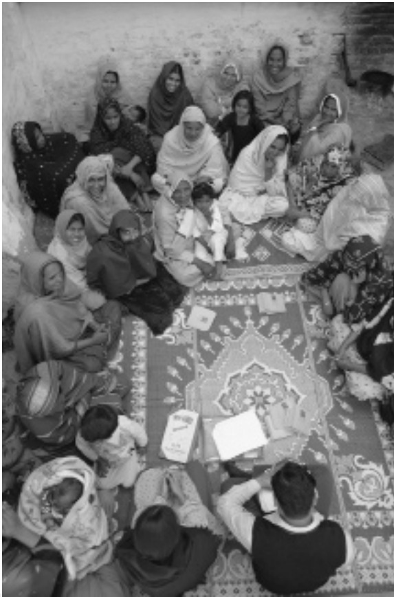
Figure 3.1 A meeting of a Kashf women's credit group in Pakistan

NGOs can be seen as development actors who can contribute to the fostering of cross-cutting social ties and networks which might form the basis for collective action and increased levels of democratic participation. The role of NGOs in organizing people at the grassroots can therefore be viewed as strengthening social capital, a role that may complement the delivery of services. For example, traditional rotating credit groups exist in many societies, in which trust between members makes possible the undertaking of group savings and loan schemes as a form of self-help initiative by small, locally formed membership NGOs. An early example of NGO-promoted group formation is the Aga Khan Rural Support Programme, set up by the Aga Khan Foundation (Box 3.3).