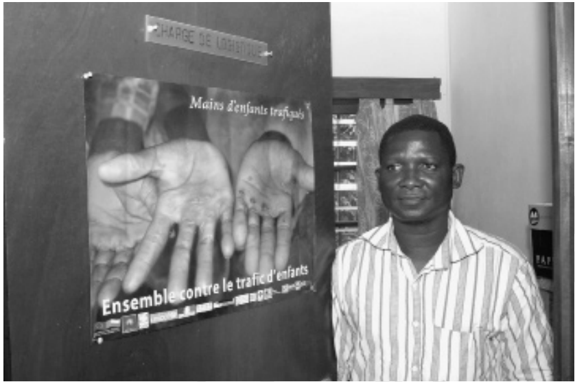
Figure 6.2 An NGO staff member in his office, Benin

For example, if a purely service delivery NGO in the health sector also advocated reform of the health system, it would become a 'civil society organization'. While think-tanks and certain types of lobby groups form part of this wider group of CSOs, it excludes self-help groups or service delivery NGOs. Blair (1997) suggests that donors can only contribute to civil society-building if they support those NGOs which are concerned with public goals, such as those seeking policy influence, rather than those doing service delivery. They can do this through two mutually reinforcing approaches: reforming the broader 'enabling environment' in terms of the 'rules of the game' which govern civil society; and supporting sectoral agendas through working directly with specific organizations. While many donors have traditionally favoured the latter, the former is a prerequisite for building sustainable change.