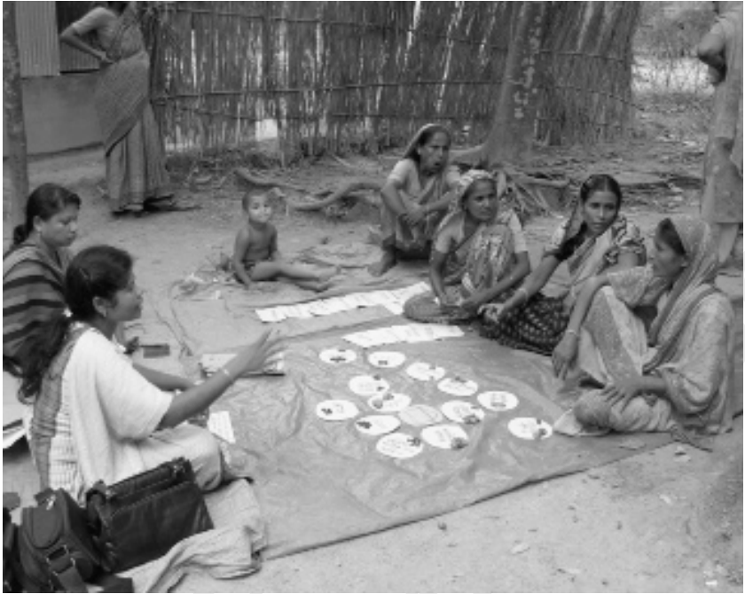
Figure 4.1 Women in Northern Bangladesh taking part in a PRA exercise facilitated by CARE staff

along with placation as the fifth rung, culminating in partnership, delegated power and citizen control as participation's higher forms.