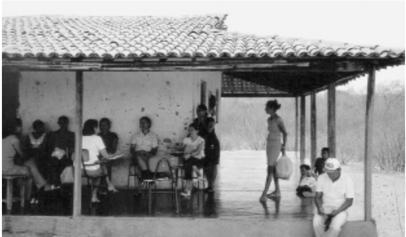
Figure 2.1 Staff from the Brazilian NGO Artesanato Solidario visit members of the ‘Onca 2’ community in the north-east of Brazil (Piauí State) in order to identify community members to undertake income-generation activities, supported by funding from the Federal Tourism Ministry

tense and unstable. Furthermore, governments tend to feel threatened if they perceive that international resources, previously provided as bilateral aid, are now being given to NGOs instead.