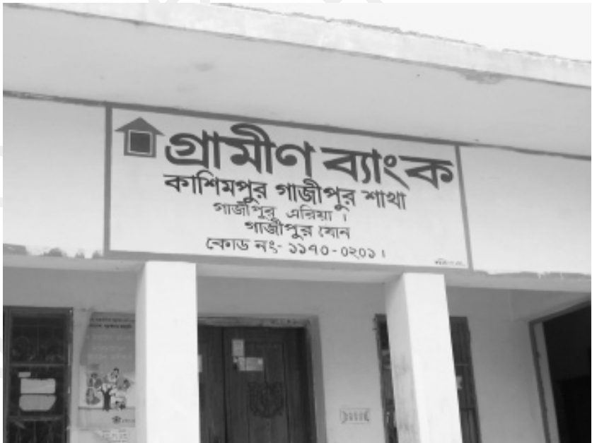
Figure 1.2 Grameen Bank local office, Kashimpur, Bangladesh

A more common-sense definition focuses instead on the idea that NGOs are organizations concerned with the promotion of social, political or economic change – an agenda that is usually associated with the concept of 'development'. This gives emphasis to the idea that an NGO is an agency that is primarily engaged in work relating to the areas of development or humanitarian work at local, national and international levels. A usefully concise definition is that provided by Vakil (1997: 2060), who – drawing on elements of the structural-operational definition set out above – states that NGOs are 'self-governing, private, not-for-profit organizations that are geared to improving the quality of life for disadvantaged people'. We can therefore contrast NGOs with other types of 'third sector' groups such as trade unions, organizations concerned with arts or sport, and professional associations. But there are also many forms of