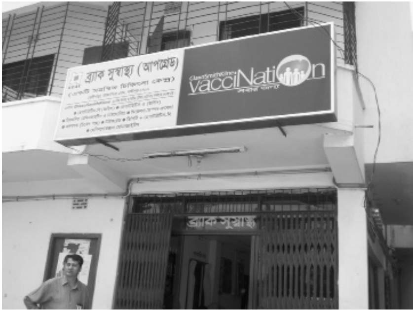
Figure 5.2 A public–private partnership for universal immunization between the Bangladesh government and GlaxoSmithKline is implemented by BRAC through its health centres

not only in itself, but as a way of gaining legitimacy and as an entry point for advocacy.’