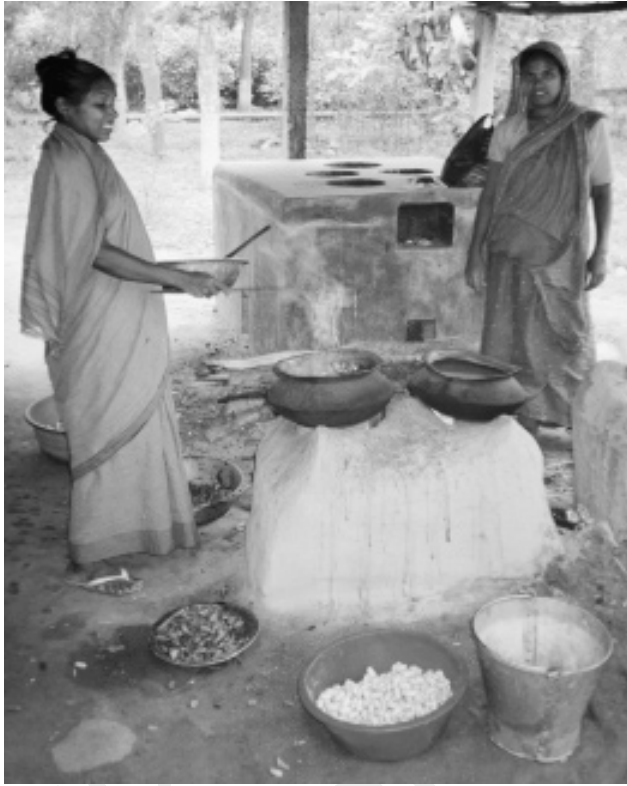
Figure 4.3 NGO members engaged in silk production part of an income-generation project run by a local NGO

Also generating obstacles to empowerment was the organizational self-interest of the NGO itself. Some NGOs in Bangladesh have also found it difficult to ‘let go’ of the groups that they have helped to form, either because the groups chose to remain dependent because they continued to see the NGO as a useful ‘patron’, or because the groups became too important for an NGO’s legitimacy or its revenue for them to be released from the relationship. For example, NGO-formed women’s groups which became involved in silk production within a World Bank-funded project were unable to ‘go it alone’ and become independent producers’ groups. The income derived from the sale of silk products (bought from the groups at mutually favourable prices, but lower than the market) had become too important to some of the NGOs involved, operating as a source of income to help the NGOs reduce their dependence on donor funds (Bebbington et al. 2007).