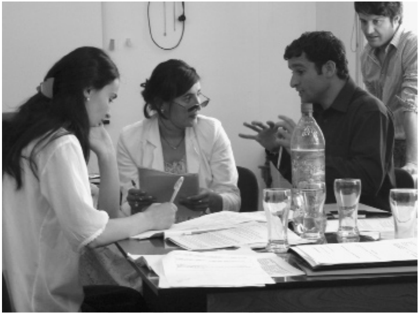
Figure 6.1 NGO staff in discussion, Tajikistan

planning) and a democratic 'civil society' in which citizens had rights as voters and consumers so that they could hold their institutions accountable. The conditions also required a free press, regular changes of government by free election and a set of legally encoded human rights (Archer 1994).