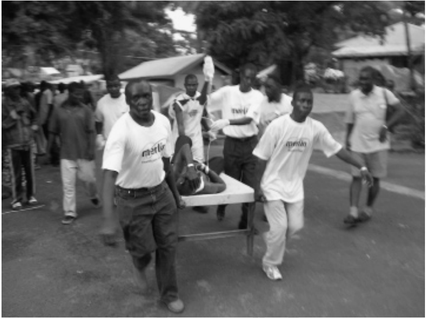
Figure 9.1 NGO staff providing emergency health services in Liberia

As long ago as the early 1990s, NGO humanitarian work had come under criticism for the ways that agencies failed to cooperate with each other and, even more seriously, undermined the efforts both of government and of local voluntary groups, as Abdel Ati (1993: 113) wrote from the perspective of Sudan: