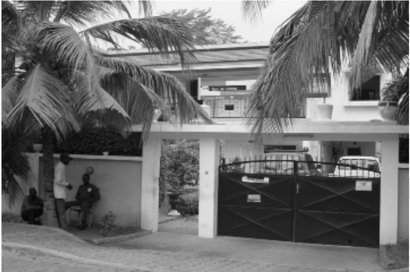
Figure 1.3 The Terre des Hommes office in Cotonou, Benin

conceptualize this evolutionary process in generational terms (Table 1.1). In the first ‘generation’, an NGO’s most urgent priority is to address immediate needs, mainly through undertaking relief and welfare work. In the second, NGOs shift towards the objectives of building small-scale, self-reliant local development initiatives, as they acquire more experience and build better knowledge, and may become more influenced by other agencies, such as donors. A stronger focus on sustainability emerges with the third generation, and a stronger interest in influencing the wider institutional and policy context through advocacy. In the fourth generation, NGOs become more closely linked to wider social movements and combine local action with activities at a national or global level, aimed at long-term structural change.