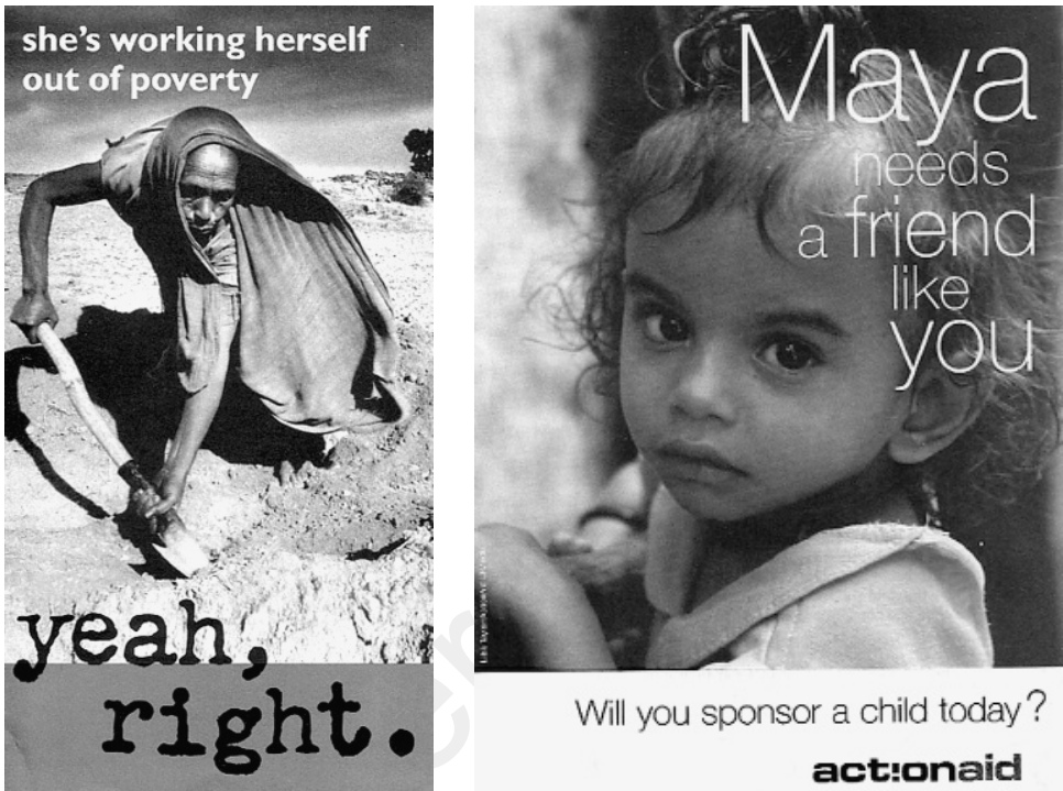
Figure 8.1 Contrasting NGO fundraising images within the aid system – critique of mainstream income-generation approaches (War On Want) and child sponsorship (ActionAid)

was later changed to 10/90 in 2005 (Onsander, 2007). In other parts of Europe the figure is often much lower. In 2006, the Irish NGO Concern Worldwide received 79 per cent annual income of £13.1 million from public donations and only 20 per cent from grants from governments and other contracts (Annual Report 2006). For Oxfam GB, from a total annual income during 2006/7 of £290.7 million, 24.2 per cent was from official sources and the rest came from fundraising and trading (Annual Report 2006–7).