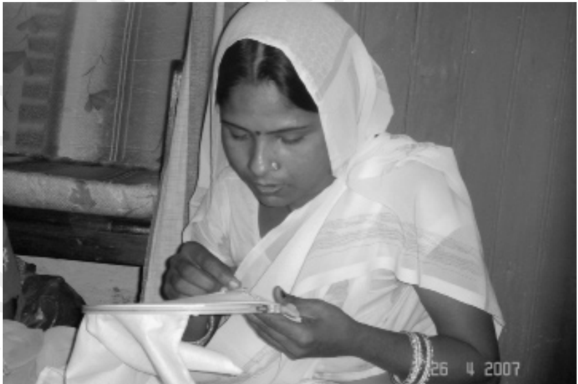
Figure 2.2 Handicraft self-help group member, Karauna, Uttar Pradesh, India

The concept of ‘philanthropy’, defined as ‘the ethical notions of giving and serving to those beyond one’s immediate family’, has