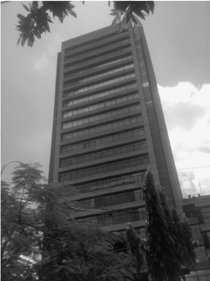
Figure 1.1 BRAC headquarters, Dhaka, Bangladesh

A key point to note is that NGOs can now almost be seen as a kind of tabula rasa , a ‘blank slate’, onto which a range of current ideas, expectations and anxieties about development are now projected (Lewis 2005). For example, for radicals who seek to explore