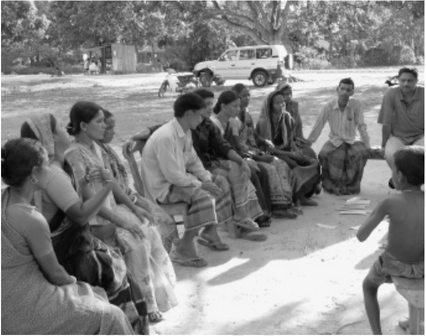
Figure 4.2 NGO workers from CARE Bangladesh discuss empowerment issues with rural women

often come to be used in quite different ways (Box 4.1). For some, empowerment was an individual process which provided the means for people to advance their own well-being and interests. For others, empowerment implied forms of collective action, centring on issues of organization and politics.