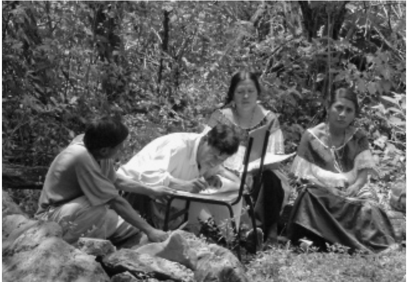
Figure 3.2 The Mexican NGO Centro de Derechos Indígenas (Indigenous Rights Centre) has been working with indigenous communities in Chiapas since 1992. Here a team of four people are participating in a workshop to raise awareness about legal land rights

actors build and act on identities, such as workers, women, students or environmentalist activists, to generate these new forms of social movements which emerge out of the everyday experiences of citizens living under conditions of domination.