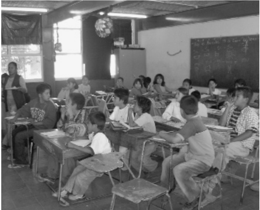
Figure 5.1 The Fundación Tracsa AC provides basic primary education services to children who tend to drop out of government schools in a poor semi-rural area of Tlaquepaque Jalisco, Mexico

Where one stands in this debate is essentially an ideological question. For those who see a role for NGOs, alongside other forms of organizations, as agencies which are competitively commissioned by government to deliver services according to social needs and their particular organizational capacity, there is no particular problem with NGO service delivery so long as the criteria for selection are transparent and performance is properly evaluated.